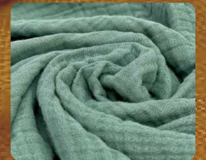
4 LAYERS MUSLIN