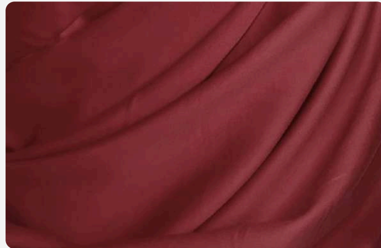
PLAIN SATIN 240CM