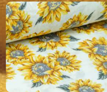
1 LAYER PRINTED MUSLIN