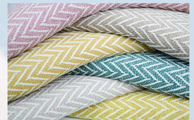
WOVEN ARMURLU PIQUE