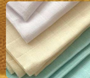
1 LAYER PLAIN MUSLIN