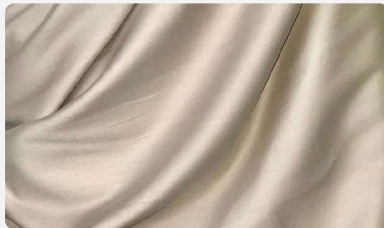
PLAIN SATIN 280CM