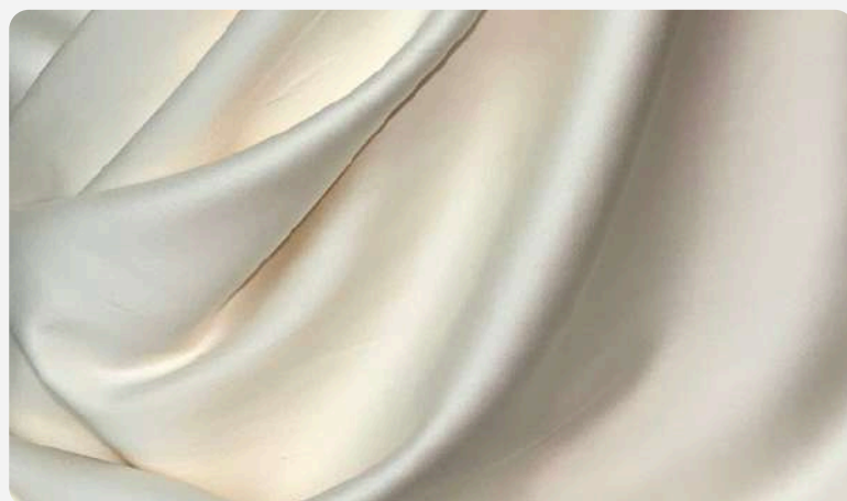
PLAIN SATIN 3 METERS