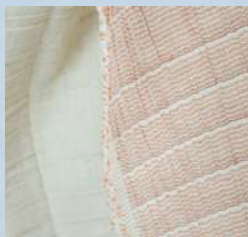
SEWED MUSLIN PIQUE