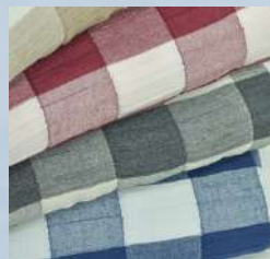
CHECKERED MUSLIN PIQUE