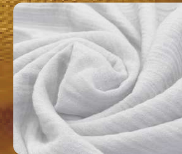
2 LAYERS MUSLIN