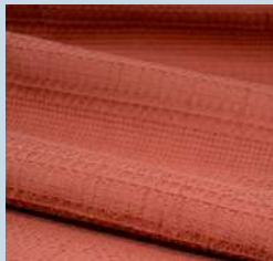
MADAM COCO PIQUE